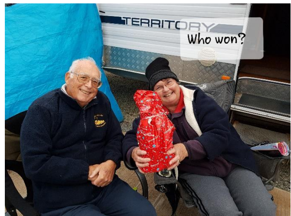
Winners of the quiz