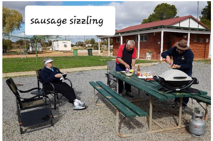
Although cold a beautiful day for a BBQ